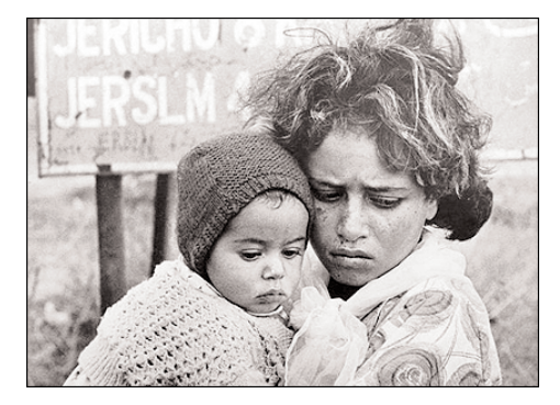
If Americans Knew.org Palestine Remembered.com